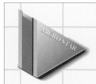
Microstar type CD