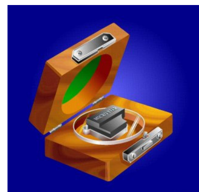
Microstar Knife in Box