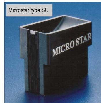
Microstar type SU