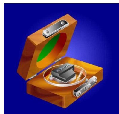
Microstar Knife in Box