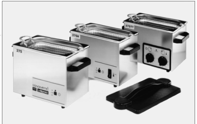
Models 375, 475, 575

All British high quality units with outer case and cleaner tank manufactured from rigid stainless steel. Power source uses double halfwave high frequency generators resulting in extremely efficient cleaning.