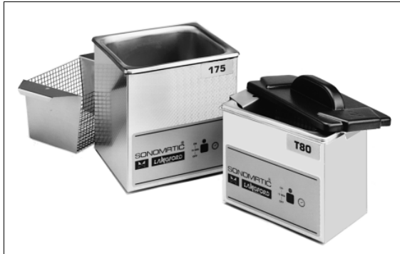
Models T80, 175