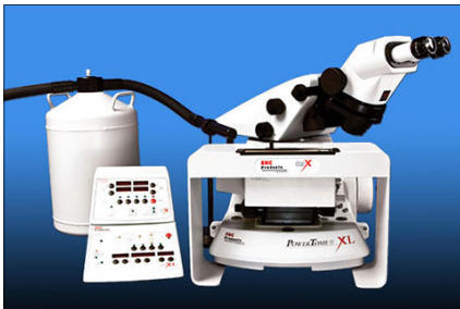
CR-X attached to MT-XL

M404 PT-PC PowerTome Ultramicrotome 230v 50Hz or 115v 60Hz