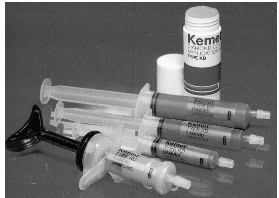
Kemet KD Diamond Compound application Stick